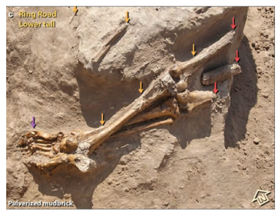
Figure 44c as published by Bunch et al., which was also photoshopped. Sun angle can be inferred from shadows but contradicts the north arrow annotation added by Bunch et al. to the image taken at Tall el-Hammam latitude in winter. Colored arrows are annotations added by Bunch et al. to point out features in the photograph.

Moore, C.R, et al. 2021. A giant space rock