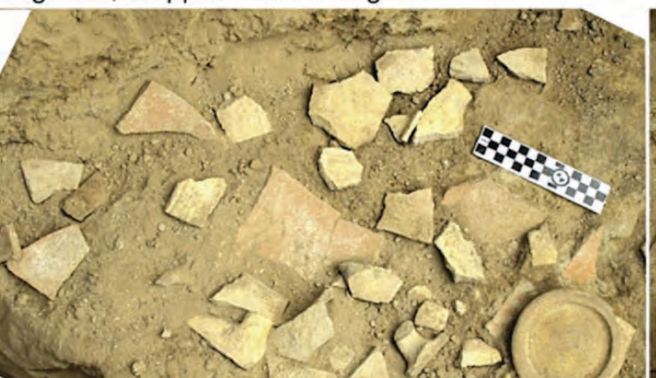
Fig. 15b, cropped rotated original

Altered image to remove red arrow and fill corners