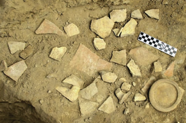
One of seven sets of original and altered images uploaded to PubPear by Allen West in response to criticisms. We know from other images that the red object at the bottom of the original is a north arrow that points to ten o'clock.

Altered image to remove red arrow and fill corners